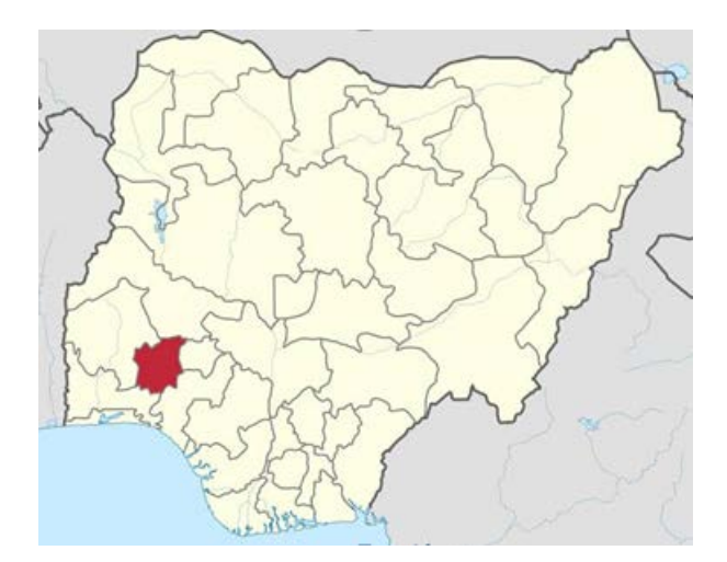
Figure 1. Map of Nigeria showing Osun State.

The Osun State Agency for the Control of AIDS (OSACA), with support from World Bank, coordinates the multisectoral response to HIV/AIDS programme through various technical working groups saddled to facilitate data collection, analysis as well as to provide leadership and direction to all HIV/AIDS programme in the State.